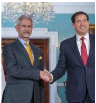
Marco Rubio, US Secretary of State, with S Jaishankar, External Affairs Minister

“The Secretary and External Affairs Minister discussed formalising bilateral co-operation on critical minerals exploration,